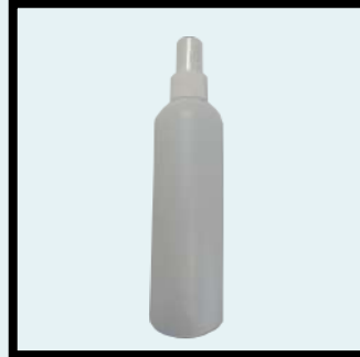
PE0250.BOS + Pump 250ml Sanitizer Bottle