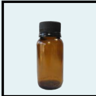
BP094.A/F + Cap 50ml Medica Bottle