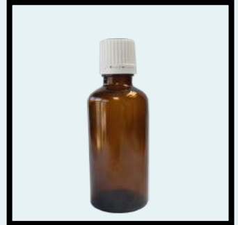
Z0050.A + Cap 50ml Dropper Bottle