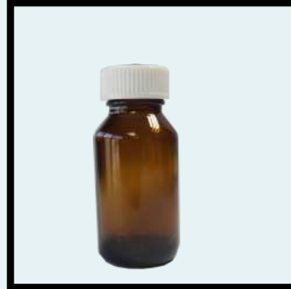
W0101.A + Cap 25ml Medical Bottle