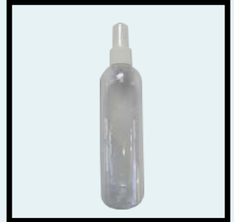
PET0250.BOS + Sprayer 250ml Sanitizer Bottle