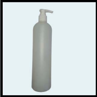
PE0500.BOS + Pump 500ml Sanitizer Bottle