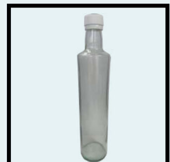
ZC1451.F + Cap 500ml Flint Bottle