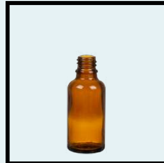
W0030.A + Cap 50ml Dropper Bottle