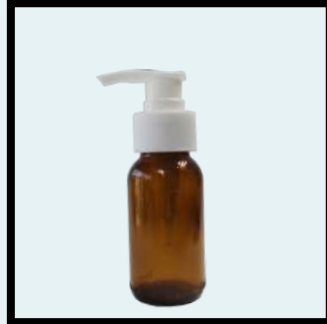
BP0034.A + Pump 100ml Medical Bottle