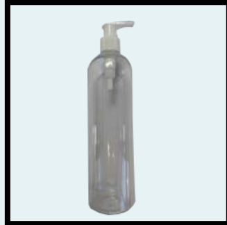
PET0500.BOS + Pump 500ml Sanitizer Bottle