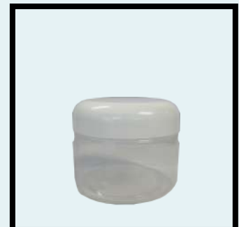
HOM030.B + Cap 10ml Dropper Bottle