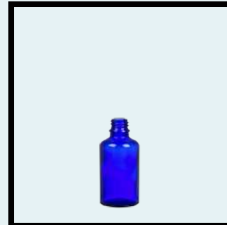
HOM010.B + Cap 10ml Dropper Bottle