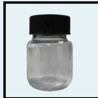
W0049.F + Cap 50g Ointment jar