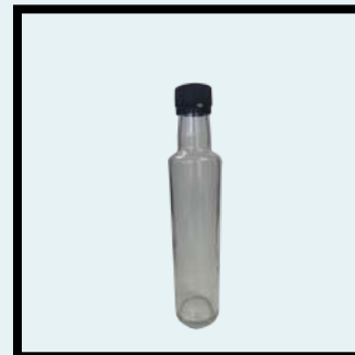
ZC1450.F + Cap 250ml Flint Bottle