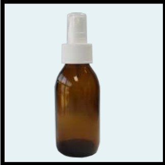
BP0034.A + Sprayer 100ml Medical Bottle